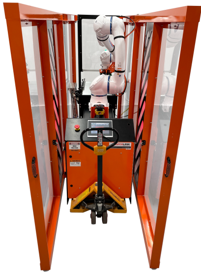
mobile frame folds to allow transport through 4' opening with pallet jack