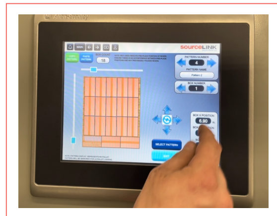
powerful, simple pallet-building software included