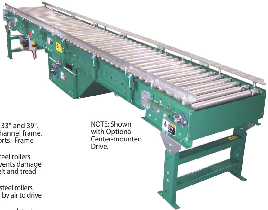
NOTE: Shown with Optional Center-mounted Drive.

Capacity - See Load Capacity Chart. 150 pounds max. unit load.